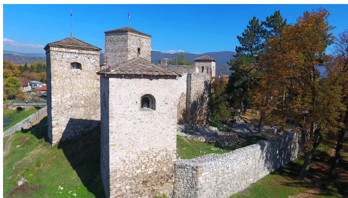
Fortress Kale, Pirot

Ministry of European Integration has launched a new website dedicated to promotion